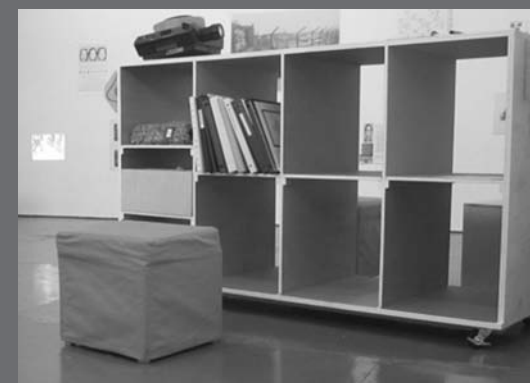
Images clockwise from top left: United Net-works On the Road , Image courtesy of Southern Exposure; Vapors by Kato Jaworski, Image courtesy of the artist; Remembering by Judy Spiegel, Image courtesy of Mio Nishi Good.

Coming up next in the PROJECT series is an installation of Vapor 6 by Kato Jaworski (March 29 - April 17) and in-gallery performances by The Susan O'Malley Research Team, a duo of artists whose work is rooted in social practices and art performance.